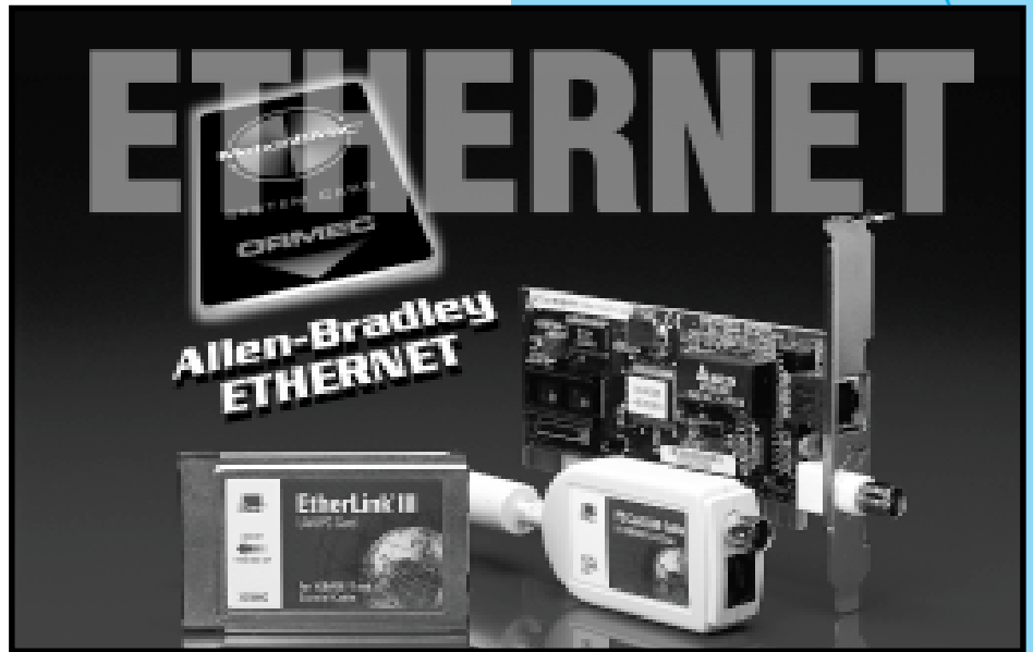
ORMEC provides standard Ethernet installation hardware for the ORION® A-B Ethernet MBX option.

The A-B Ethernet MBX extends the MotionBASIC® operating system to provide connectivity between ORION® controllers, Allen-Bradley PLCs and PCs running popular HMI packages by using A-B Ethernet communications. An ORION® controller with an Ethernet link installed and configured with the A-B Ethernet MBX, can open an A-B connection to send application data to any A-B server node on the network. The ORION® controller also has the ability to start a server node that will accept any connection from another A-B node and receive application data.