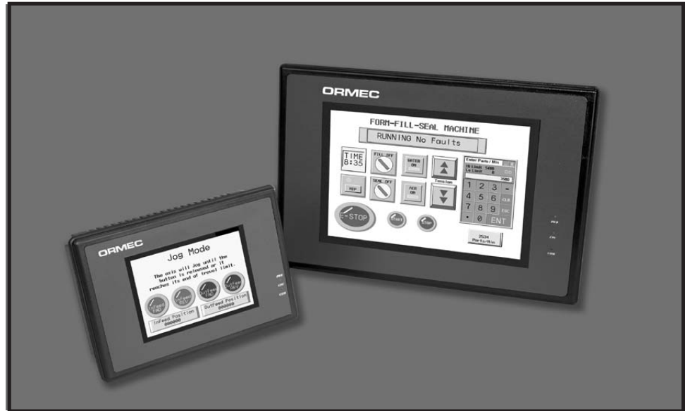
ORMEC's touchscreen operator interfaces provide a fully graphical, easy to use human-machine interface.

MMI-320/640 touchscreens include built-in recipe management, allowing for easy storage and retrieval of machine setup parameters. Having this powerful capability in the HMI eliminates the need for developing recipe management in the machine control application program, saving