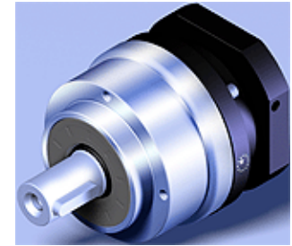
The AE-Series are the cost-effective option.