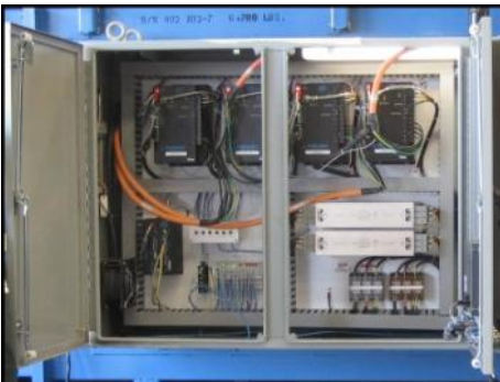
Custom integrated panels are provided with UL certification.