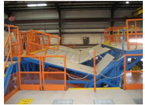
Retractable drop decks are moved into position.