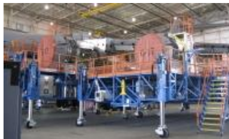
Aircraft mechanics are given easy access to aircraft components with the underwing maintenance platforms.

The moveable platforms retract to allow the plane to be positioned and once the engines clear, the sections are can be automatically moved back into position.