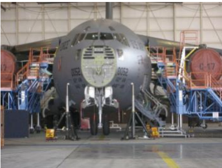
Two underwing maintenance platforms for the C-17 are operational at Robins Air Force Base, Georgia.

High-precision and highly reliable servo systems and software control movement of the platform work surfaces to provide a safe and efficient work area. Automatic sequencing insures that all four sections of the platform move synchronously to each other. The positions for each section of the platform can also be adjusted individually via operator touch screens.