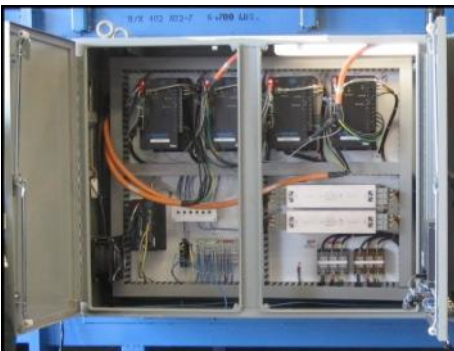
Custom integrated panels are provided with UL certification.