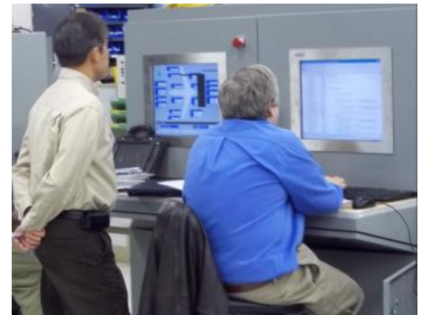
An intuitive operator interface provides the information and command for efficient operation..