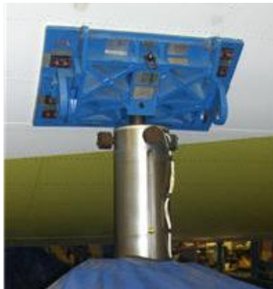
High speed drive based I/O with micro-second position capture are used for precise alignment of positioning jacks.