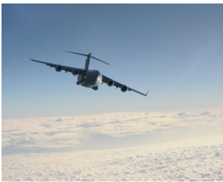
C-17 aircraft assembly uses advanced, precise motion control for the Major Join tool automation.

For the airframe components to be properly joined, the use of high-precision and highly reliable servo systems and software is essential. An intuitive graphical interface improves assembly operations time by providing operators the visualization of information required to control the automatic positioning. Individual adjustments to jack positions can be made via operator touch screens.