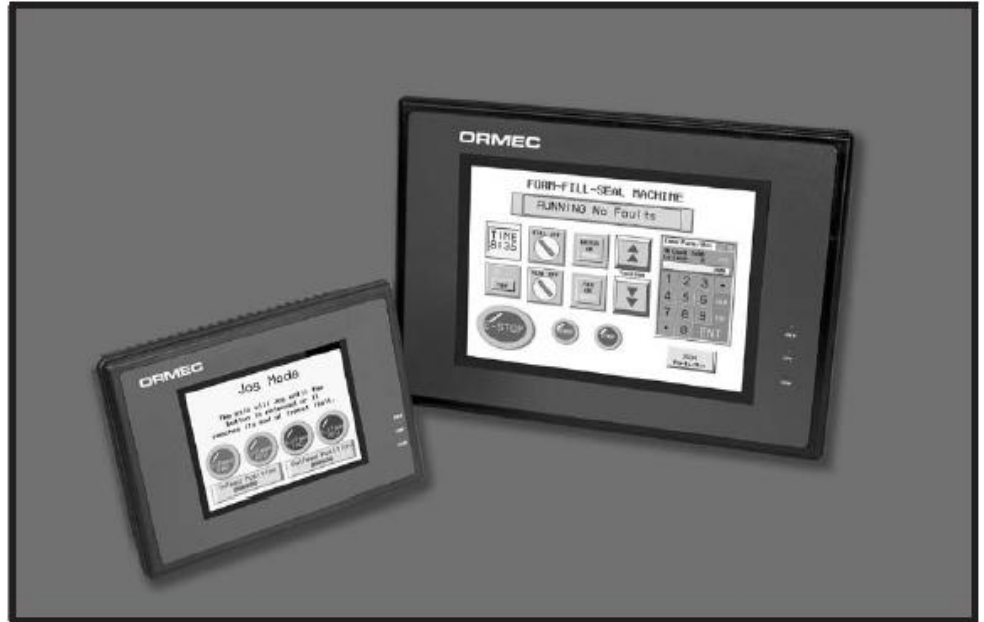
ORMEC's touch screen operator interfaces provide a fully graphical, easy to use human-machine interface.

The EasyBuilder Software includes built-in recipe management, allowing for easy storage and retrieval of machine setup parameters. Having this powerful capability in the HMI eliminates the need for developing recipe management in the machine control application program, saving software development time and simplifying the system design. Each MMI-8000 unit is shipped with the latest revision of the EasyBuilder 8000 development software. The latest version of the EasyBuilder 8000 software is always available to be downloaded from the ORMEC web site, www.ormec.com .